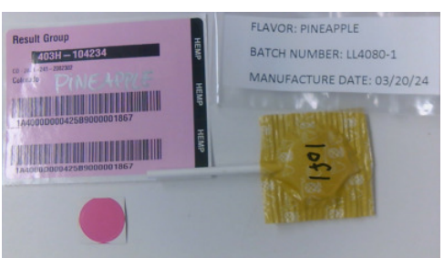
Apr 10, 2024 |